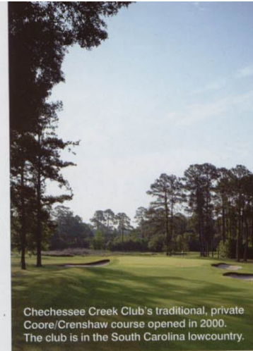
Chechessee Creek Club's traditional, private Coore/Crenshaw course opened in 2000. The club is in the South Carolina lowcountry.

Luxury golf properties throughout North Carolina's Triangle region begin at $500,000. The area's highest priced listing is $4.395 million in Hasentree, Raleigh's newest golf course community.