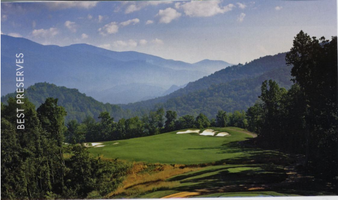
The golf course at Balsam Mountain Preserve is surrounded by picturesque scenery, including land protected by a conservation easement.

Balsam Mountain Preserve, Sylva, N.C. – Of its 4,400 stunning acres, 3,000 will remain undisturbed and protected by a conservation easement. Managed and maintained by the non-profit Balsam Mountain Trust, the preserved land includes open green spaces, lush forest, wildlife habitats and 38 miles of pristine streams. Other portions of the land divide the 354 home sites. The community, which opened in 2003, also boasts a nature center with knowledgeable naturalists who offer guided hikes and mountain bike rides for exploring the beautiful surroundings, and educational bird-watching excursions. 866-452-3456; balsammountainpreserve.com .