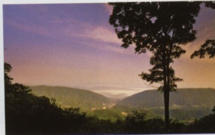
Homes nestled into the natural environment of Homestead Preserve boast views of lush wooded areas, open pastures and mountain peaks.

The Preserve at Little Pine, Marshall, N.C. – Located on 1,800 acres, this park-like community will preserve approximately 15 acres for every homesite (85 percent of the land) through protective covenants and a conservation easement managed by the Smoky Mountain National Land Trust. With their private homes tucked into the mountain wilderness, homeowners can explore the old-growth forest, wetlands, meandering streams and high mountain meadows on guided hikes, mountain biking excursions or on horseback. 866-658-8441; littlepine.info .